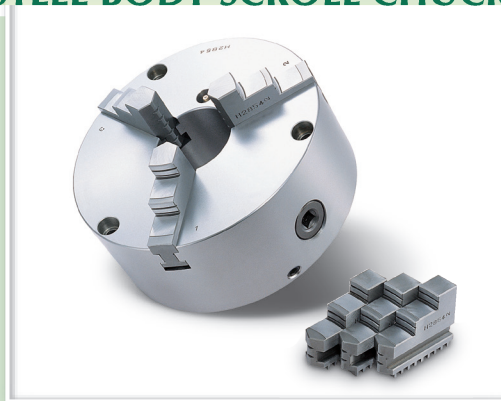
規格表 » Specifications