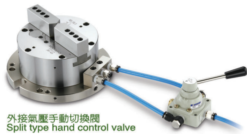
外接氣壓手動切換閥 Split type hand control valve

氣壓切換閥連接方式 / 特殊附件 Examples of Attaching Pneumatic Manual Switch / Optional Accessories