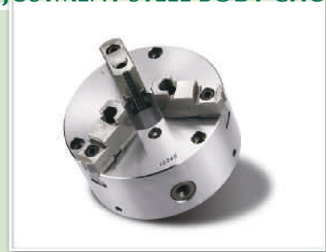
規格表 » Specifications